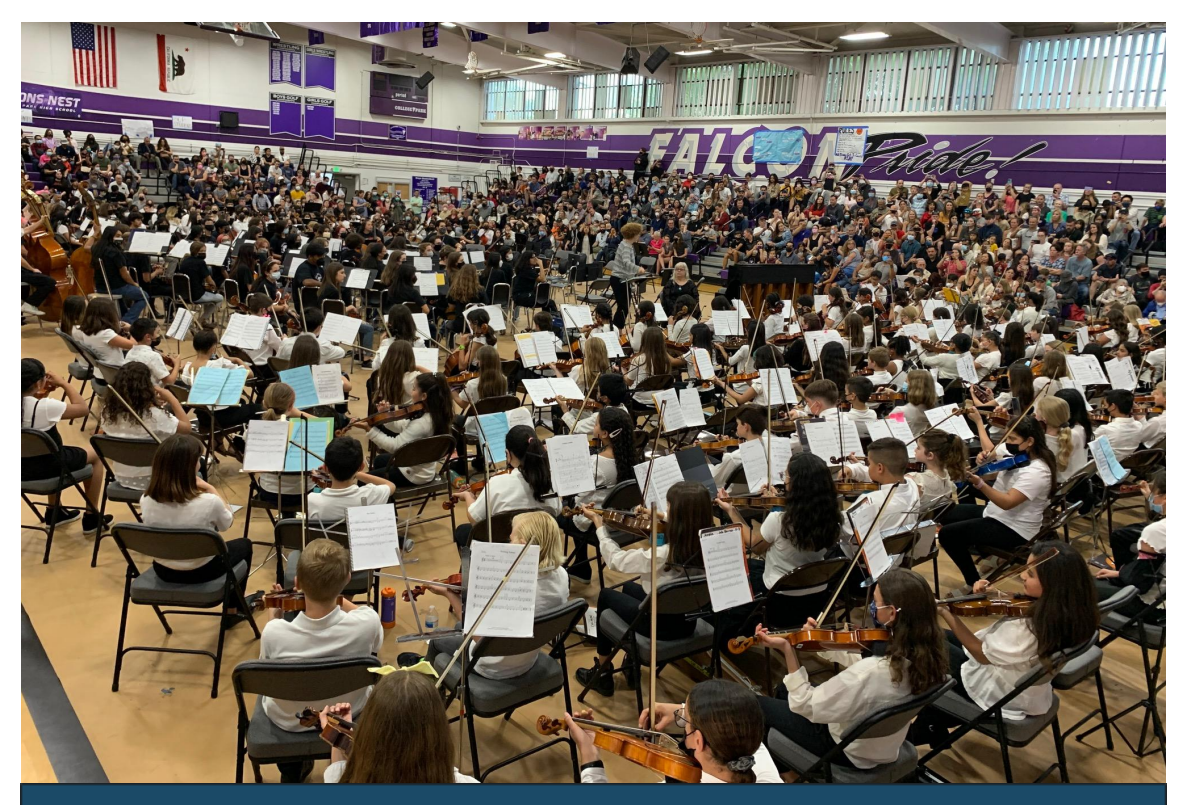
"The most significant learning occurs when emotions are integrated with instruction because all body systems are united. The arts are strongly linked to emotions, enhancing the likelihood that students will remember something."

- Eric Jensen, author and educator, Brain-Based Learning