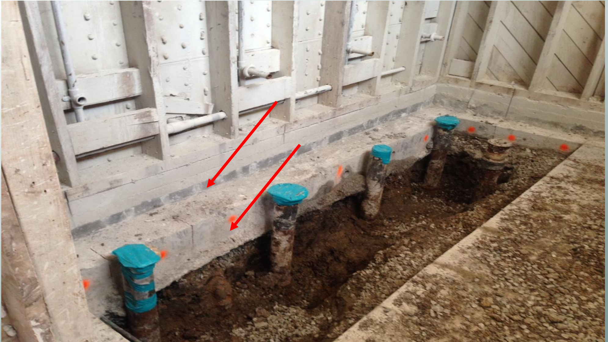
Concrete Slab – Riverview MS