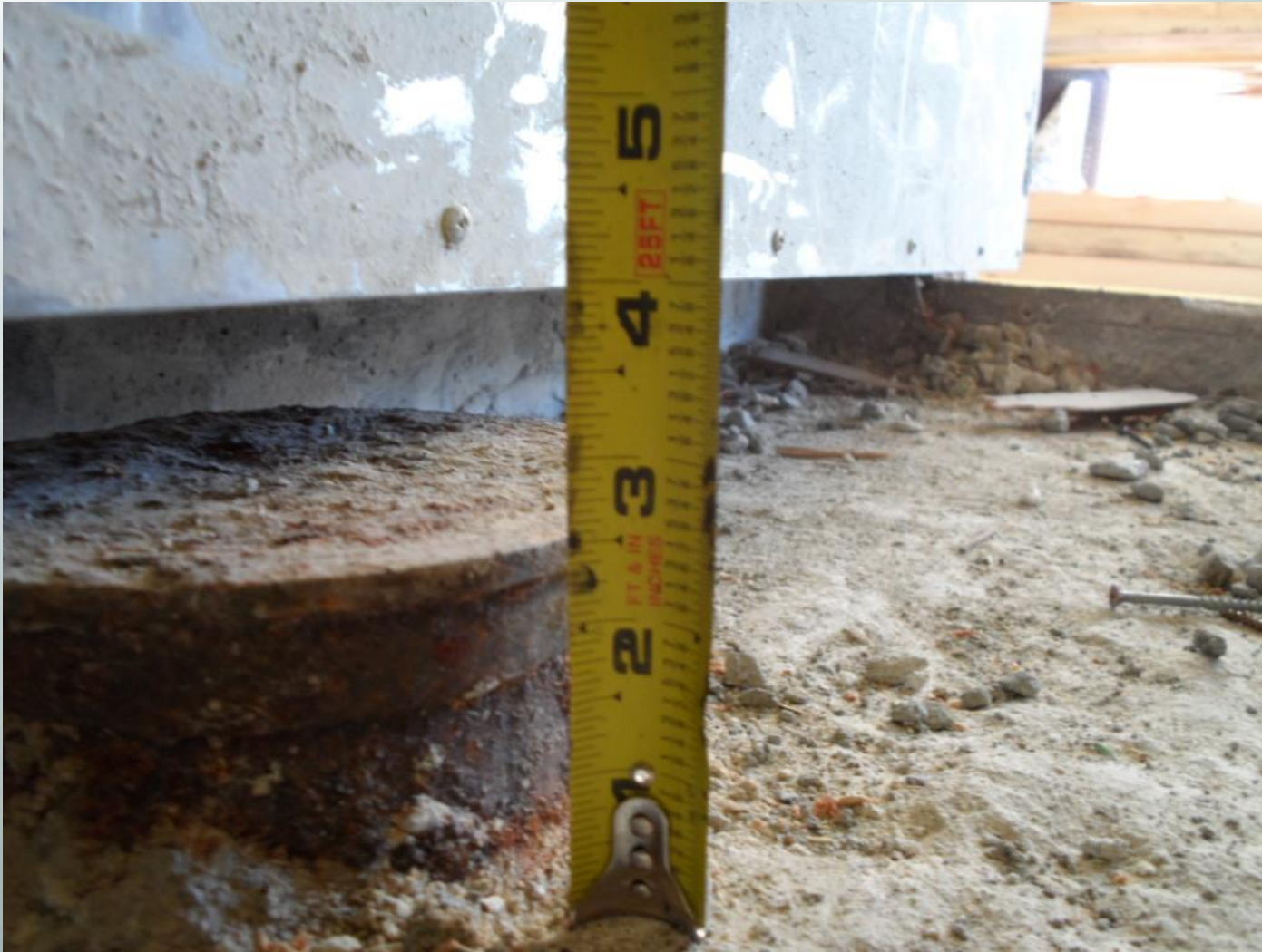
Grout Bed – Riverview MS