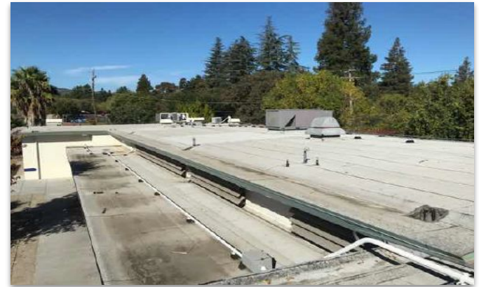
Pleasant Hill MS