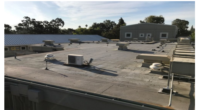
Valley View MS