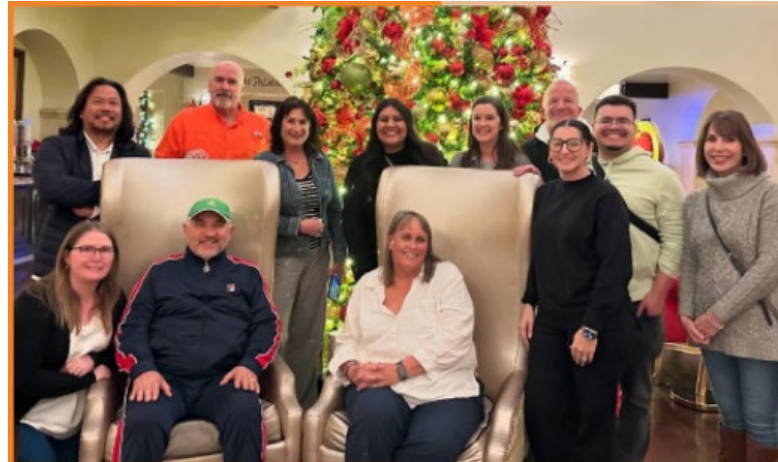
MDUSD Career Pathways team attends Career and Technical Education Conference