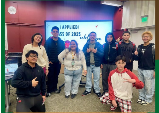
Mt. Diablo HS students and College & Career advisor highlighted for senior applications to 4-year universities

Goal #2: Highly qualified, culturally proficient and responsive staff will create a safe and engaging learning environment respectful of all students' backgrounds ensuring they are college and career ready when they graduate.