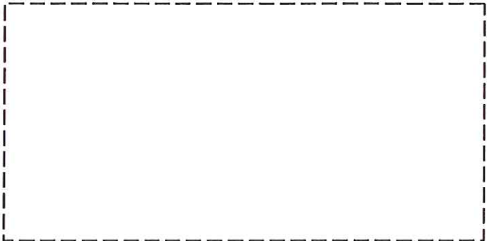
Place Seal Above

ACKNOWLEDGMENT (by Corporation, Partnership, or Individual) (Civil Code §1189)