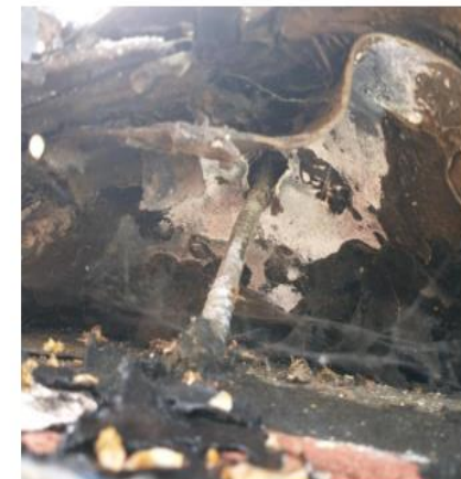
Guy wire anchor pulling out of roof.