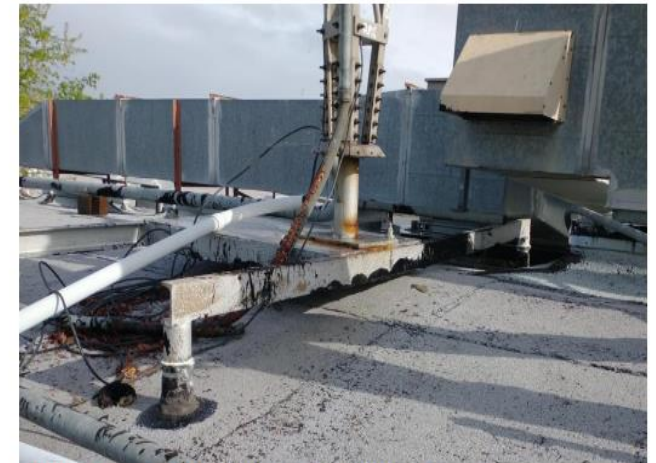
Deflection in tower support mounting frame